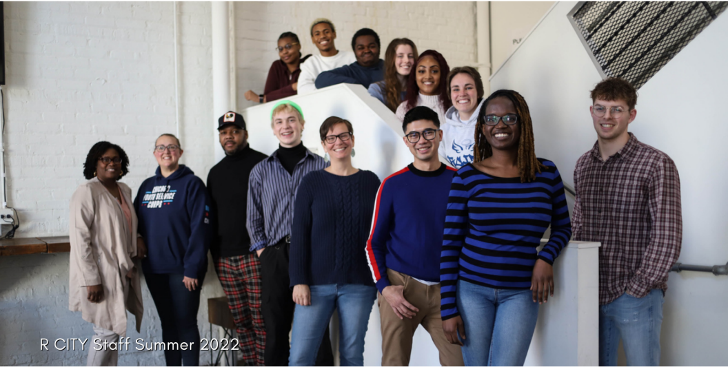
R CITY Staff Summer 2022

In a year when our staff has doubled , we know the impact committed individuals have on the scope of services we are able to provide our community. In the midst of rapid growth, R CITY has the benefit of an experienced board of directors characterized by hope for the good that can come from our work and a staff team eager to love , challenge and encourage our youth.